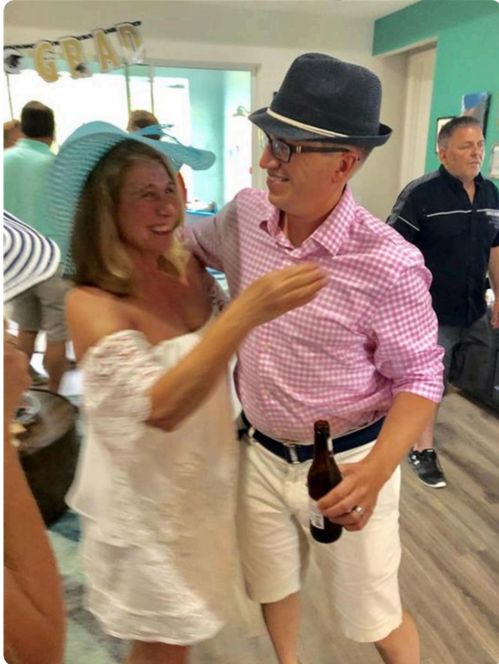
Athena's UCF Grad party/Kentucky Derby Day